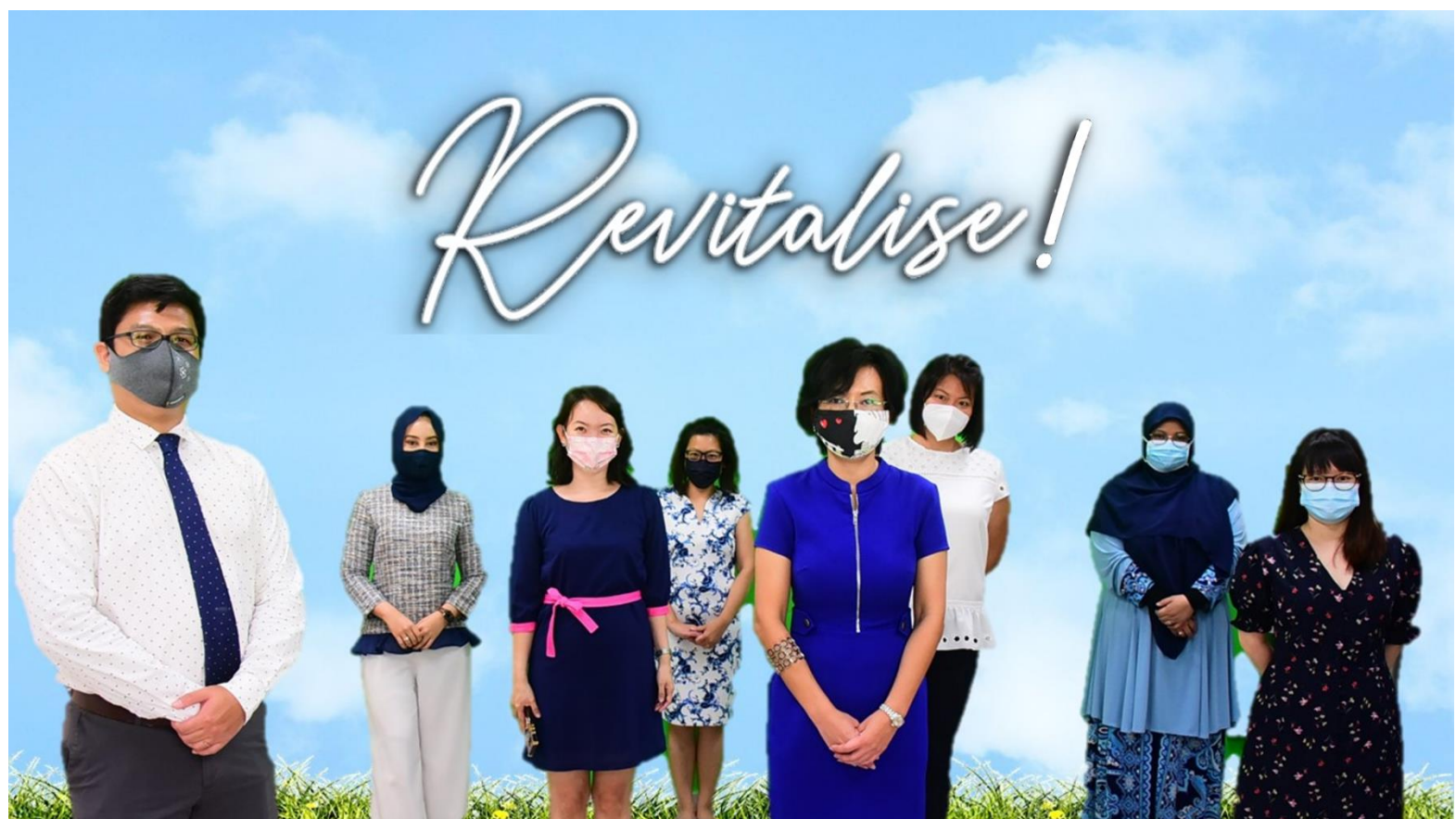
Speech Day Committee and support team