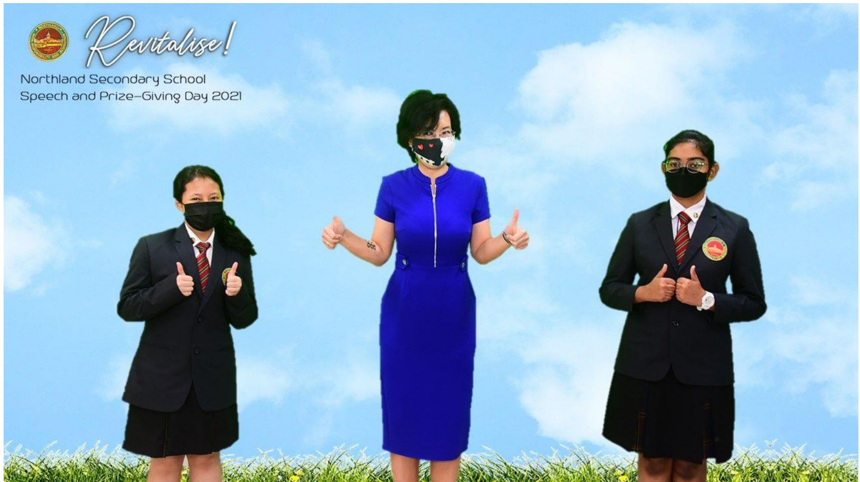
Mdm Tan with our Emcees